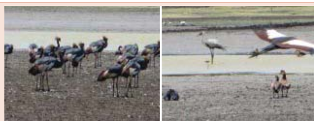
Figure 10: Ecotourism and fisheries are assumed to be an appropriate intervention in Welala wetlands of lake Tana.