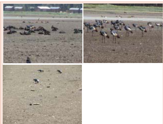
Figure 9: Highly populated birds and remnant dead fishes eaten by birds in the highly shrunk and almost dried Welala wetlands.