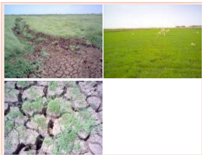
Figure 5: Lack of irrigable water that shows cracked soil and poor plant color of Eragrostis teff that might lead to wilt and death of a plant prior to ripe.