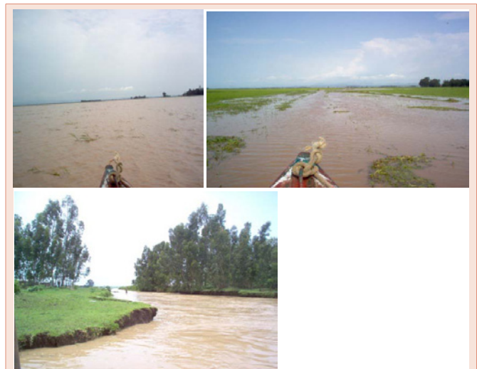
Figure 2: Shesher reservoir during rainy season, and joining Lake Tana from left to right.

During pick dry season of March, 2012 the survey showed unexpected, amazing and sudden death of a home for many biodiversity and life full of Shesher natural resource dried up totally and birds fetch their food from remnants small shrieked wet mud spot (Figure 3). This happened due to several and unlimited human encroachments for different activities mainly for crop cultivation, with out any rules and regulations. Major crops cultivated by drained Sheshers water using gravitational force were Eragrostis teff , Cheak pea, Lentils and Safflower (Figure 4). It seems the community lacks knowledge and awareness about Shesher reservoir wetland of sustainable use other than exploiting beyond its maximum limit.