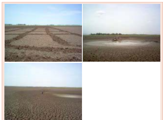
Figure 3: Total dried up of Shesher reservoir with shrieked mud aggregated by birds at the center.