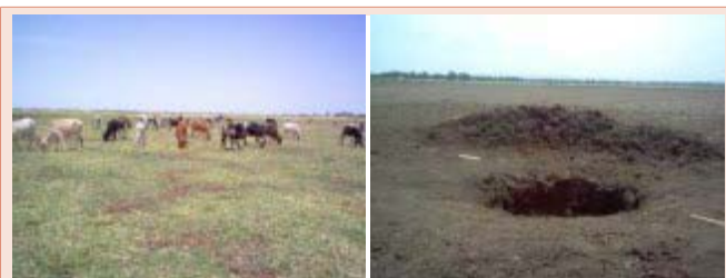
Figure 7: Digging ground water (Well) at the center of Shesher reservoir for their animals after complete dried up of the reservoir.

According to the 100 interviewed respondents from Shesher and Welala surrounding villages, replied that 100 % of them were engaged in fishing especially during pick and post rainy seasons of a year. About 95% from Shesher and 75% from Welala responded that they were using the wetlands for cattle grazing through out the year in the previous years. According to the Intergovernmental Panel on Climate Change (IPCC).The new knowledge enables IPCC to improve their