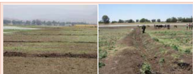
Figure 8: Furrows of Welala reservoir with 50 m intervals at both sides of farm lands to irrigate their crops.