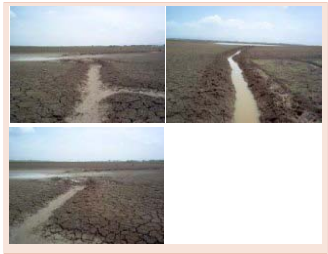
Figure 6: Uncontrolled drainage of Shesher reservoir for irrigation purpose until it totally dried up from the area.

6). Water could not be found even for drinking of their animals and for themselves, as a result they started digging of the ground to fetch water for themselves and their animals (Figure 7).