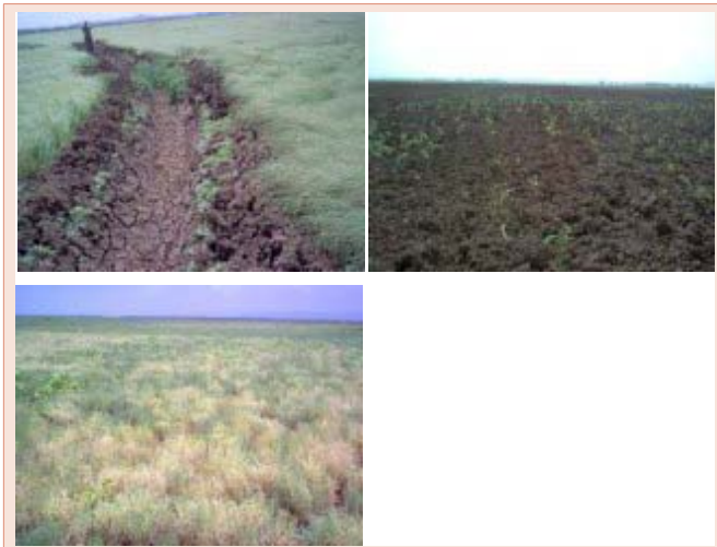
Figure 4: Major crops cultivated by draining water through furrow irrigation system from Shesher reservoir of Lake Tana wetland.

Such type of irrigation system in Shesher reservoir could not be recommended practice because it is not well studied and high pressure was imposed from four kebele inhabitants of its surrounding without calculating its carrying capacity, it drained until the water lost from the area by making furrows even followed its small shrinkage (Figure