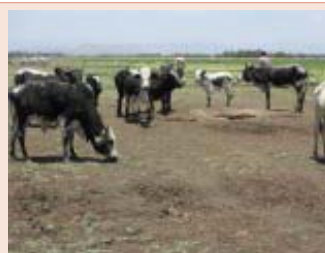
Figure 11: A paradox, cattle production system awaiting for watering from the well and supplemented feed stuffs from crop residues.

methodological guidance for monitoring greenhouse gas emissions from wetlands significantly. In the current IPCC guidelines (2006), considerable gaps exist with regard to emissions of wetlands, and particularly with respect to rewetting of drained peatlands. Peatlands drained for practices such as agriculture or forestry are significant sources of emissions, which can be reduced by rewetting (increasing the water Table 1) [5]. According to [6] a total of 274 benthic macro-invertebrate individuals belonging to 5 families were collected, 32, 699 individual birds belonging to 62 species were enumerated and 13 species of macrophytes were identified.