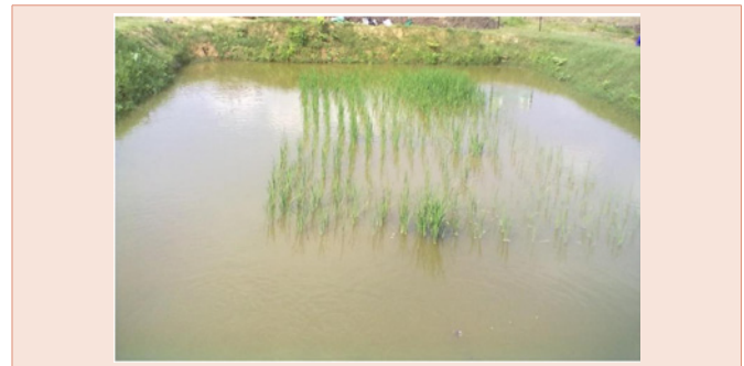
Plate 2: Integrated Fish Farming in University of Ibadan, an adaptation strategy to climate change impact.

Creation of easily accessed Regional, national and local depositories