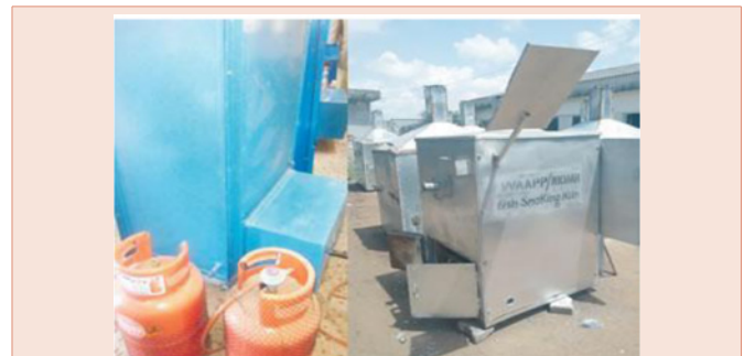
Plate 4: Gas powered fish smoking kiln developed in NIOMR under the sponsorship of WAAPP.

for climate and allied data will be necessary so as to increase capacity in information technology and modeling of climate change data. Suitable adaptation and mitigation measures should be site specific to respond to anticipated changes in rainfall and temperature in Nigeria. Models for sustainable fisheries management and aquatic resources conservation would be required for regeneration of fish stocks and ecosystems.