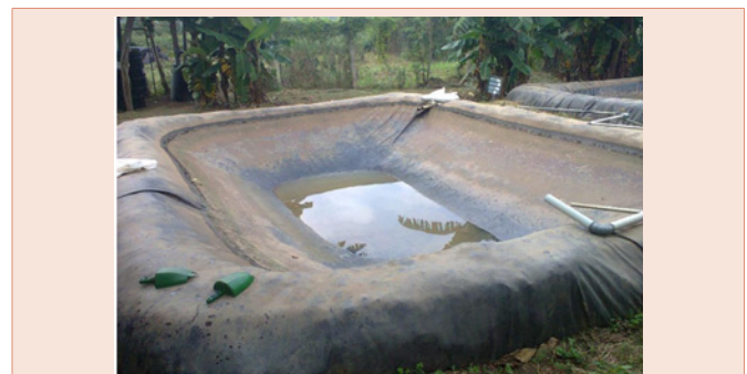
Plate 3: Pond lined with Tarpaulin at CHI Limited: an adaptation strategy to water infiltration during dry season.