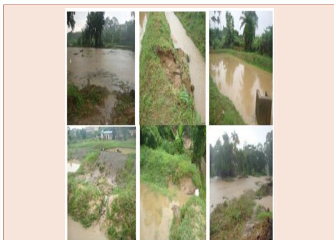
Plate 1: Flooded University of Ibadan Fish Farm.