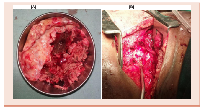
Figure 4: [A] Excised pseudoaneurysm; [B] Opening in subclavian artery closed directly by prolene 6-0.