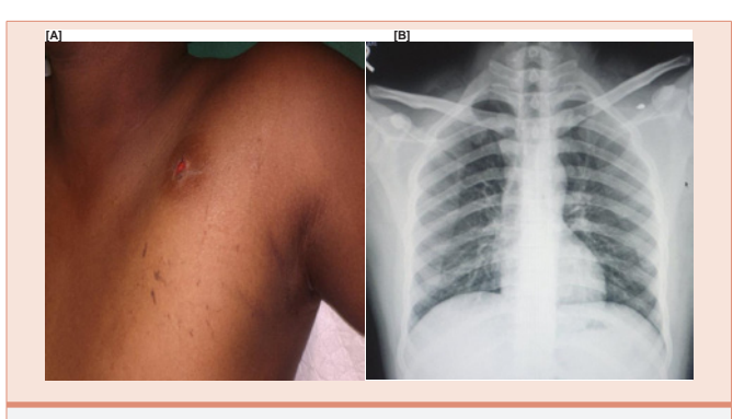
Figure 1: [A] Entry wound in supraclavicular region due to stone chip; [B] Chest X ray showing radio opaque stone chip below left clavicle.

with prolene 6-0 directly. After putting 14 number negative suction romovac drain in supraclavicular and axillary region, wound closed in layer (Figure 5). Skin sclosed with stappler .Radial and ulnar artery