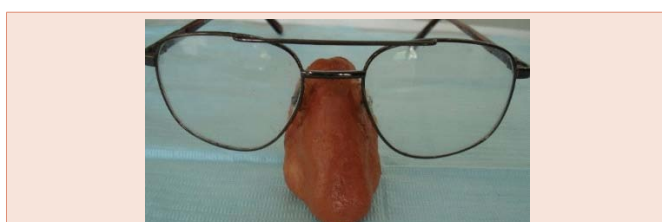
Figure 3: Nasal prosthesis with eye glasses.