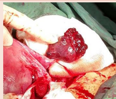
Figure 1: Isolated fallopian tube torsion.

The vital signs of patient were normal. With the surgical consultation, the patient was treated for diverticulitis. On the third day of hospitalization, the laparotomy was done in spite of mild contractions. The cesarean was completed. Adnexa on the right was completely normal. Similarly the left ovary was normal. While the left fallopian tube was found at the site of injection Ampula to Fimbriae torsion. According to fourth cesarean of the patient, salpingectomy was performed (Figures 1-4).