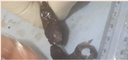
Figure 3: Paratubal cyst in fimbriae.