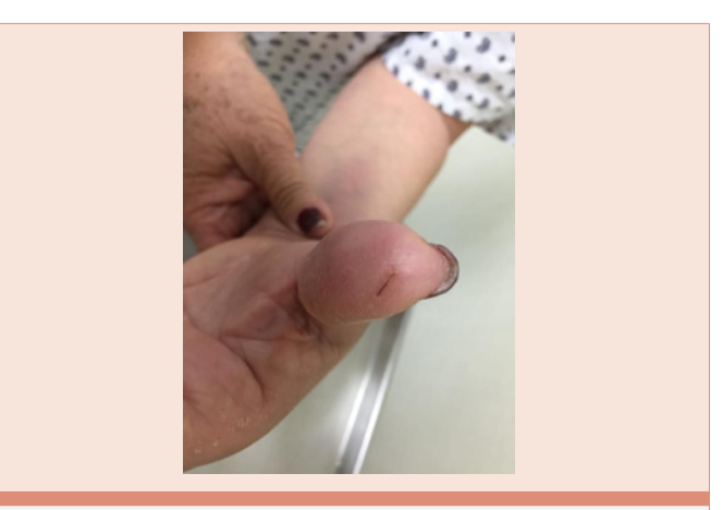
Figure 1: Lacerations on the anterior surface of the fingerprint part of the thumb; the wound was shaped regularly with no secretions caused by the sheep bite.

a sheep bite on her thumb. The sheep was sick because a dog bite, the dog has been properly vaccinated. Patient stated that the first symptoms, with redness of thumb fingerprint, swelling and pain appeared 12 hours after the bite, over time (24 hour) they became worse. Clinical examination revealed a little lacerations on the anterior surface of the fingerprint thumb (Figure 1), the wound was regular in shape without secretions. The thumb, volar forearm and wrist were painful, erythematous, and edematous. (Figure 2) There was no evidence of conditions and past procedures that may put the patient at greater risk, such as diabetes, liver disease, immunosupression or splenectomy. The patient was no febrile and she was feeling well except for important pain (in 8 in 0-10 VAS). There were no clinical signs of systemic infection. Laboratory results showed: PCR 201 mg/L,