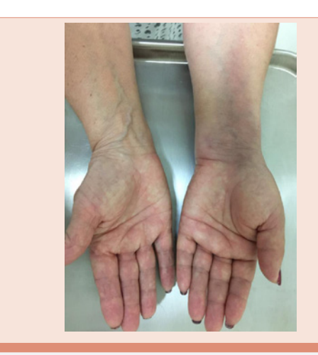
Figure 2: Thumb, thenar zone, volar forearm, and wrist pain in addition to erythematous and edematous two days after sheep bite.