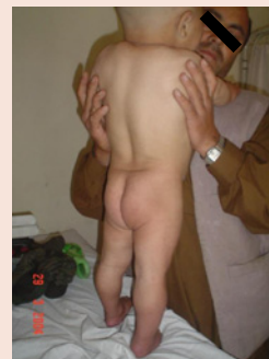
Figure 2: Child at presentation: Note the hypertrophied calf, back, gluteal and quadriceps muscles, giving the child a 'prize-fighter appearance'.