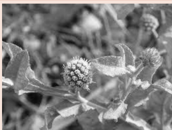
Figure 20: Sphaeranthus indicus.