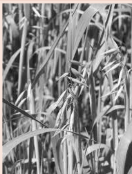
Figure 3: Avena sativa.