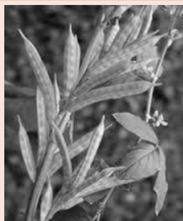
Figure 8: Cyamopsis tetragonoloba .