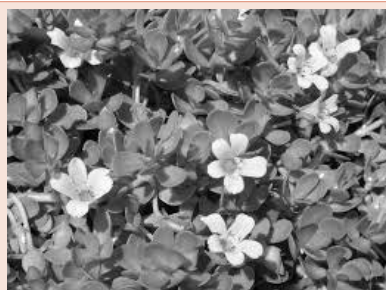
Figure 4: Bacopa monniera.