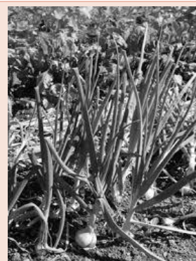
Figure 1: Allium sativum.

Bacopa monnieri: The plant material of B. monnieri was extracted and was fed to the hypercholesterolemic rats. Biochemical and histological changes were analyzed and found decrease in the levels of Total cholesterol, TG, plasma lipid, LDL, VLDL, atherogenic index, LDL/HDL ratio and Total cholesterol/HDL ratio but increase in the levels of HDL compared to HCD fed rats. These results suggest that