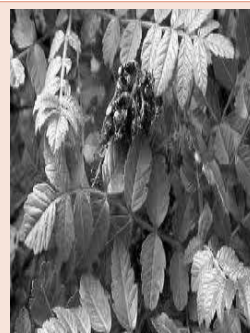
Figure 17: Rhus coriaria.

Sesbania grandiflora: The aqueous extract of leaves of S. grandiflora (SG) was administered a dose of 200µg/kg ( p.o ) to the triton induced hyperlipidemic rats. SG shows a significant decrease in the levels of serum cholesterol, phospholipids, triglyceride, LDL, VLDL and significant increase in the level of serum HDL at the dose of 200 µg/kg ( p.o. ) [38] (Figure 18).