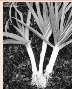
Figure 2: Allium porrum.