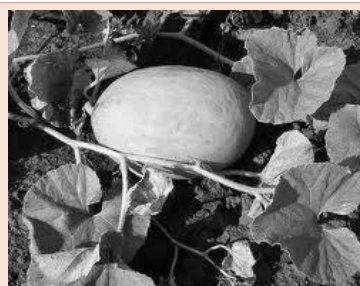
Figure 7: Citrus mitis.