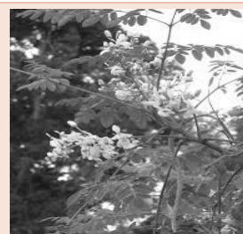
Figure 12: Moringa oleifera .