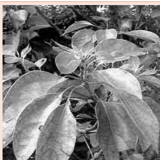
Figure 5: Cinnamomum tamala.

this plant protects against biochemical changes and aortic pathology in hypercholesterolemic rats [22,23] (Figure 4).