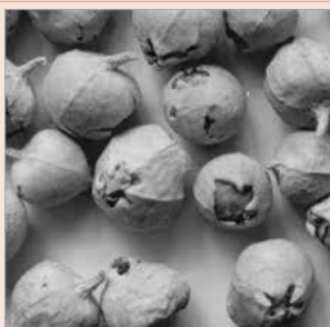
Figure 21: Withania coagulans.