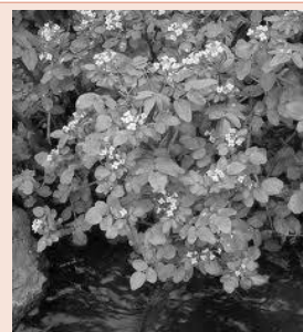
Figure 13: Nasturtium officinale .