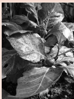
Figure 22: Ziziphus oenoplia.

Solanum macrocarpon: The leaves and fruits of S. macrocarpon were administered ( p.o. ) for 7 days to Wistar rats at doses of 400 and 800 mg/kg of body weight and Atorvastatin was used as a reference drug. Administration of S. macrocarpon resulted in a significant decrease in total cholesterol, LDL, VLDL and triglycerides and increase in HDL was observed in the treated groups [39] (Figure 19).