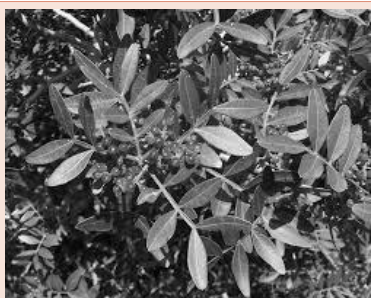
Figure 15: Pistacia lentiscus.