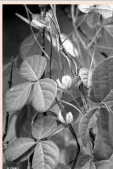
Figure 10: Macrotyloma uniflorum .

ethanol extract-treated groups was significantly higher than those treated with water extract. Body weight in the water extract treated groups was significantly lower than that in the ethanol extract-treated groups [30] (Figure 10).