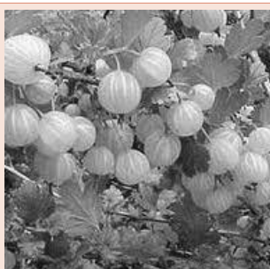
Figure 9: Emblica officinalis .