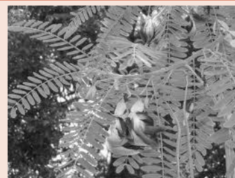
Figure 18: Sesbania grandiflora.