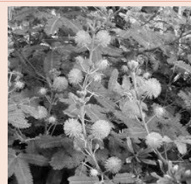
Figure 11: Mimosa pudica .

Phyllanthus reticulatus : Experimental rats were divided into different groups: normal, hypercholesterolemic control and P. reticulatus treated (250 and 500 mg/kg b.wt. doses for 45 days). The aqueous extract of P. reticulatus (250 mg and 500 mg/kg) produced