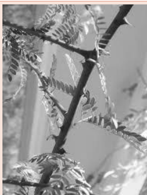
Figure 16: Prosopis cineraria.

significant reduction in TG, VLDL, total cholesterol (TC), LDL and oxidative stress (protein carbonyl) while increase in HDL [34] (Figure 14).