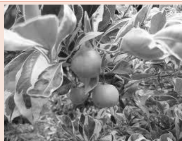
Figure 6: Citrus mitis.

Macrotyloma uniflorum: Animals were fed with experimental high-fat diets (HFD) The consumption of ethanol and water extract of experimental plant for 5 weeks caused the decrease in total cholesterol (TC), TG, LDL, VLDL, SGOT and SGPT and increase in HDL and the rat group fed with HFD has higher serum TC, TG, LDL, VLDL, SGOT, SGPT, and lower HDL. Faecal excretion of cholesterol in the