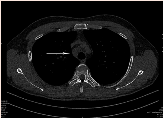
Figure 1: High-resolution CT showing enlarged paratracheal lymph nodes (arrow).