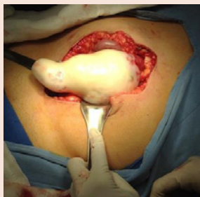
Figure 3: Smooth and pearly colour surface, 12 x 8 cm tumor protruding from the appendix.