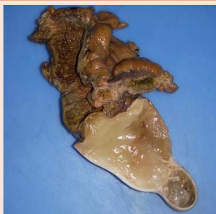
Figure 4: 15 x 7.5 x 6 cm cecal appendix with abundant mucus inside and fibrous septum that divide his light.

1) adenoma, 2) mucinous neoplasms of uncertain malignant potential or low-grade mucinous neoplasm and 3) adenocarcinoma [1-3].