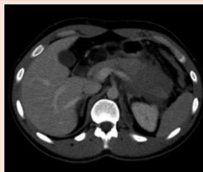
Figure 1: CT: Complete transection of pancreas.

Approximately the 65% of pancreatic lesions occurs in the neck and body the remaining ones, take place at the head and tail [3]. Around the 90% of the patients with pancreatic trauma shows up concomitant small bowel lesions, and because of the anatomic