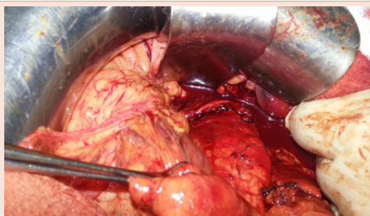
Figure 3: Intraoperative image, distal pancreatectomy preserving splenic vessels.

proximity and irrigation sharing, duodenal lesions are the most common, as well as vascular structures [1,3,5,7]. Exist a 5-grade classification (AAST) of the pancreatic trauma describing the presence of hematoma, laceration, site of lesion and the integrity of the pancreatic duct and its complications [8]. In most of the cases, late deaths are from infection and sepsis, generally from pancreatic or hollow viscus injury [5].