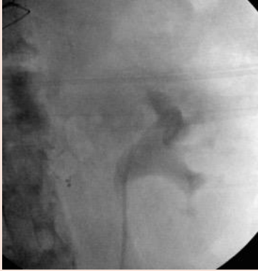
Figure 2: Retrograde pyelogram post JJ stent placement.

flow oxygen, fluids, and noradrenaline. Intravenous paracetamol was given, a target-controlled infusion of remifentanyl was initiated, and the procedure commenced. The patient was comfortable throughout, with minimal cardiovascular instability due to instrumentation of the urological tract. Resuscitation continued throughout the procedure with adjustments made to achieve optimal oxygen delivery to the tissues. Mixed venous saturations achieved a maximum of 64.9%. The procedure finished promptly within 10 minutes.