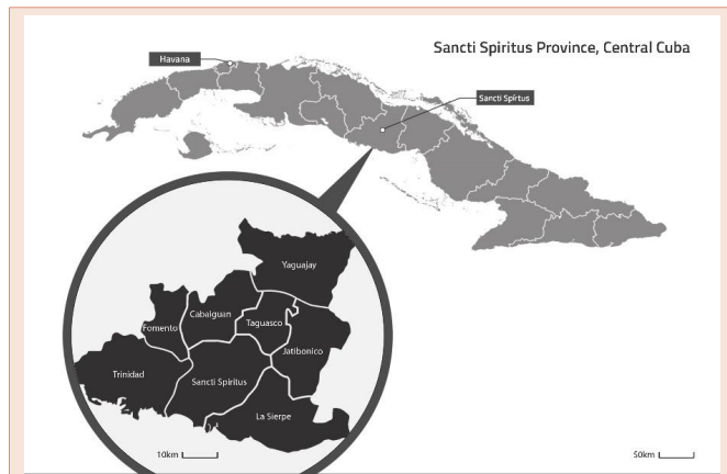
Figure 1: Map of Cuba showing the location of the Sancti Spiritus Province and its corresponding municipalities. (see attached).

Only patients with definitive clinical diagnoses were included in the study. Clinical diagnosis of acquired OT was defined by the presence of classic active focal retinochoroidal inflammation without associated retinochoroidal scars in either eye as well as a response to therapy as expected. Furthermore, these patients had no history of prior documented episodes or symptoms suggestive of prior episodes. A diagnosis of congenital OT was made based on multiple factors including: the presence of quiescent retinal toxoplasmic scars before the age of seven years, complications, and retinochoroidal lesions in the mother. Because of the presence of old scars in some patients, the exact time of onset of ocular disease who could not be determined and these patients were classified as undetermined.