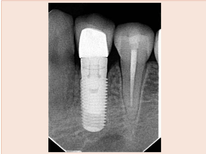
Figure 4b: Radiograph of the final implant crown.

and immediately loaded. In a randomized clinical trial, [7] one year implant survival rate of immediate implants was found to be 96.6% in immediate loading group and 93.3% in conventional loading group (where loading was done after 3 months). However, several factors are needed to be taken into account when following the immediate protocol of implant placement. These include a surgical technique to ensure primary stability of the implant, sufficient quality and quantity of bone and keeping the implant off occlusion initially to reduce micro movements [8].