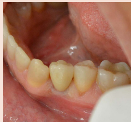
Figure 4a: After the placement of the permanent crown.

micro movements [4]. Lindeboom in 2006 [5] showed that after 1 year of implant placement, there was no statistically significant difference in gingival esthetics or complications in immediate versus delayed group. In a study by Jo et al. [6]. A success rate of 98.9% was observed for implants that were placed in fresh extraction sockets