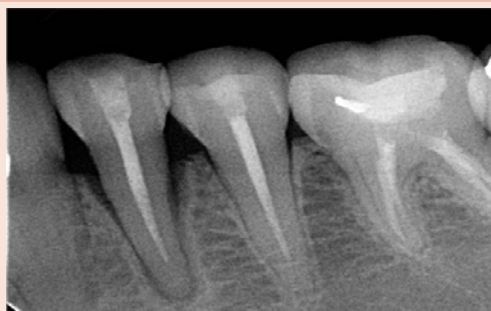
Figure 1: Initial radiographic presentation of the lower left premolar that was periodontally compromised.

After clinical and radiographic examination, procedure of implant surgery and prosthetics was explained to the patient and written informed consent was taken. The patient was medically fit and there was no contraindication for the procedure. A preoperative alginate impression of the lower arch was taken to yield a gypsum cast on which a vacuum formed suck down stent was made in the in-office dental laboratory. One cartridge (1.7ml) of local anaesthesia (2% lidocaine with 1:100,000 epinephrine) was given as a buccal infiltrate and another cartridge of same volume and strength was administered for left inferior alveolar and lingual nerve block using standard technique. An atraumatic tooth extraction was carried out using periosteal elevator, coupland elevator and mandibular extraction