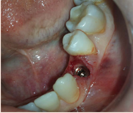
Figure 2a: Zimmer MTX, 4.7X13 mm implant immediately placed after extraction.

favour because of the possibility of alveolar ridge preservation [1] along with better bone dimensions achieved and fewer post-operative complications [3]. The results of implant survival rates in patients with immediate loading protocol versus conventional loading have been similar when careful planning is done to minimize