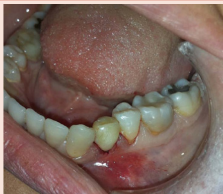
Figure 2c: After immediate temporization with an acrylic crown.