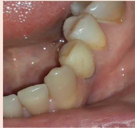
Figure 3a: Excellent tissue healing achieved after 2 weeks of surgery.