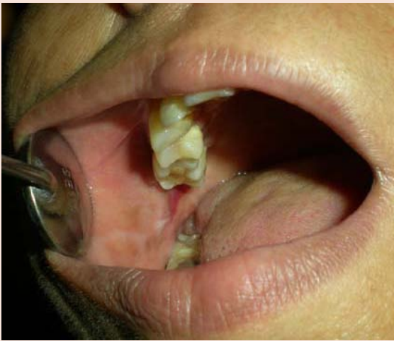
Figure 2: Intraoral hematoma distal to maxillary tuberosity.

the pterygopalatine fossa, passes inferiorly along the posterior wall of the maxilla, and enters the bone about 1 cm superior and posterior to the third molar tooth. This nerve supplies the buccal gingivae, periodontium, and alveolus associated with the upper molar teeth. It provides innervation to the pulps of all the upper molar teeth with the possible exception of the mesiobuccal pulp of the first molar, which is supplied by the middle superior alveolar nerve in approximately 50% of individuals.