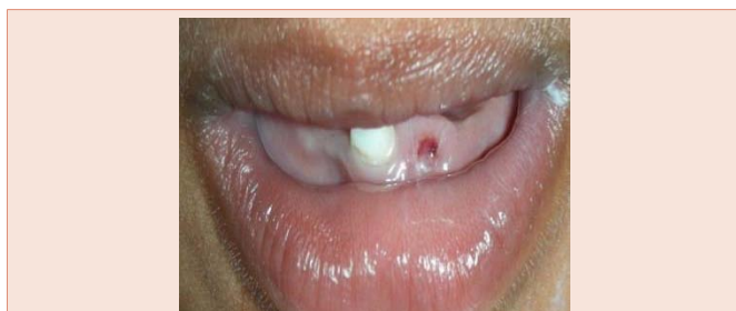
Figure 4: Surgical site following Excision.