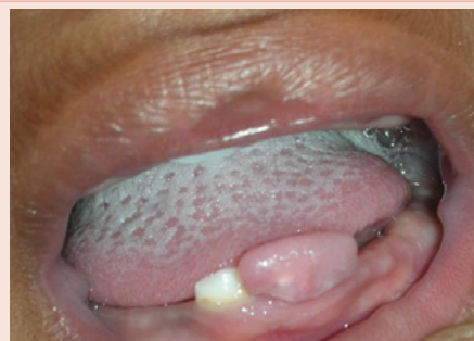
Figure 1: Facial view of the lesion beside natal tooth in mandibular anterior region.

It was decided to excise the lesion and an informed consent was obtained from the parents. A routine blood examination was done, which reflected normal findings. Under local anesthesia, the mass was excised using ligature technique, where the suture was ligated beneath the deeper part of the mass followed by excision of the lesion over the suture material (Figure 2). The tissue was submitted for histopathology examination. Microscopic examination revealed moderately cellular