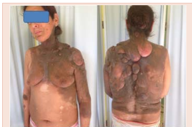
Figure 1: Congenital melanocytic nevus in 42-year-old woman.

In our patient, punch biopsies of the 2 nodular sites were