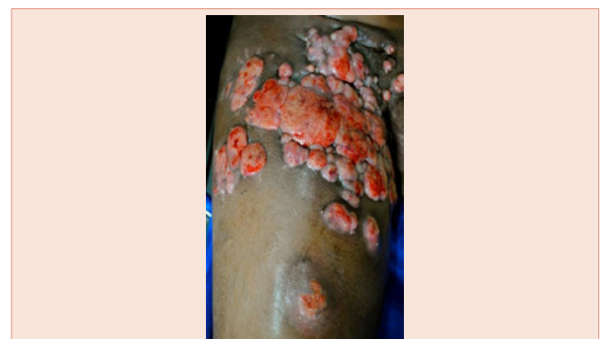
Figure 8: New lesions over the right thigh with discharge.

Unfortunately, two weeks later; patient died while at home. He was still being treated with SMX+TMP for past 6 months. According to the death certificate death due to cardiopulmonary arrest 2 o to hypovolemic shock and underlying chronic anemia.