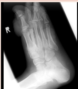
Figure 4: X-ray Right foot: Soft tissue masses in the 1st & 2nd intradigital space, beginning osteomyelitis 2nd metatarsal right.