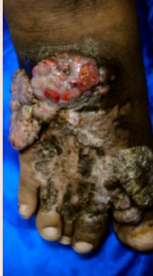
Figure 9: Discharge from the lesions over the right foot.