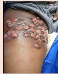
Figure 5: Lesions over the Right-Thigh spreading towards the inguinal area.