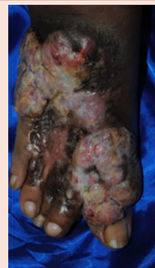
Figure 6: Lesions over the Right-foot.