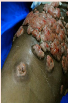
Figure 10: Improvement of lesions over right thigh and inguinal area, 3weeks after restarting SMX+TMP to the original brand.