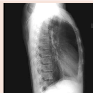
Figure 2: Chest X-ray Lateral view: Pulmonary Tuberculosis right upper lobe, Pleurodiaphragmatic adhesion bilateral.