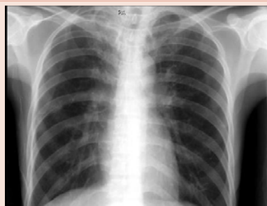
Figure 1: Chest X-ray PA view: Pleural effusion vs pleural thickening right.

His Chest X-ray PA and Lateral view revealed pleural effusion vs. pleural thickening right, PTB R. upper lobe, pleurodiaphragmatic