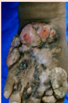
Figure 11: Improvement of lesions over right foot, 3weeks after restarting SMX+TMP to the original brand.