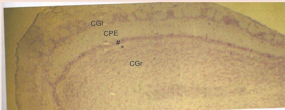
Figure 2: Histology of olfactory bulb (CGI: internal; CPE: external plexiform; CGr granule cell).

Thyroxine (T4) and triiodothyronine (T3) were assayed using commercial RIA kits and performed according to the manufacturer’s guidelines (Immunotech SA, Marseille, France). The concentrations of T4 and T3 in plasma samples were calculated from standard curves and expressed as pg/ml. The intra- and inter-assay coefficients of variation were respectively under 6.7 and 6.5% for T4 and under 6.4 and 5.5% for T3.