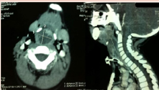
Figure 3: Axial CT with coronal view scan shows a 20 × 30 × 25 mm mass, large hypodense mass slightly less dense than the muscle, obliterating the laryngeal vestibule and invading the larynx.

Up to 1996 there were only 35 cases reported, of which 19 were in pediatric patients [1]. The clinical symptoms of the disease are those usually associated with a slow growing lesion of the larynx: the patient gradually develops hoarseness, globus sensation, dysphagia, inspiratory dyspnea on exertion, sometimes biphasic stridor [2,3]. Some patients complain about dyspnea in the supine position which seems to be associated with the location of the lesion [3,4].