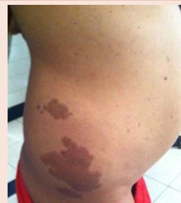
Figure 1: multiple cafe-au-lait spots over the trunk and limbs.

Modified supraglottic laryngectomy, included the resection of epiglottis, aryepiglottic folds and incomplete false vocal folds resection was indicated because the tumor infiltrating the larynx was