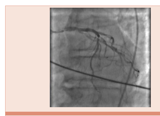
Figure 2: Coronary angiography showed: Left main coronaric trunk with critical stenosis of 60% pre-divisional.

The main blood tests: white blood cell count normal, Hb 10.7 g ^{\prime} dl, creatinin 1.5 mg/dl, K 4.2 mEq/L. Platelet 138.000.