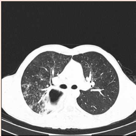
Figure 5: Perforated hydatid cyst on the right and pneumonic infiltrations on the peripheral parenchyma tissue.

Rupture is a predisposing factor for infection, which is the most serious complication. The frequency of this complication is reported between 30-90%. Infected hydatid cysts can show a thick and opacifying wall structure, similar to lung abscesses, and include air-liquid level and a pneumonic consolidation area can surround them [13]. When the cyst cavity is involved in the bronchial system, this prepares the environment for bacterial and fungal infections. The pneumonia in the peripheral parenchyma after an infection of the cyst cavity, bronchiectasis in the delayed cases and a destroyed lung are the pathologies encountered [8,10,11]. In the case that the cyst is infected, immune complex disease, glomerulonephritis, nephrotic syndrome, and secondary amyloidosis can develop [13].