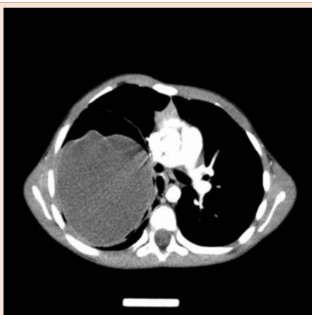
Figure 1: Giant hydatid cyst in the right lung.

Since the pericystic in the lung does not develop well as in the liver, it is more likely to rupture. An increase in the size of the cyst, which causes an increase in intrathoracic pressure, due to factors such as trauma and cough, can cause the cyst rupture [11]. The pressure inside the cyst is proportional to the cube of the diameter of the cyst. Therefore, even the smallest increase in diameter of the cyst increases cyst pressure to a serious degree and causes a large rupture risk.