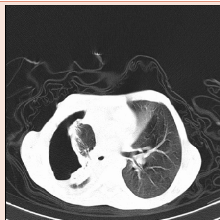
Figure 6: Collapsed lung due to the giant perforated hydatid cyst on the right.

In our series of 412 cases where surgical procedures were examined and in our series of 176 cases where the complications related to perforated hydatid cysts, the rate of pleural complication