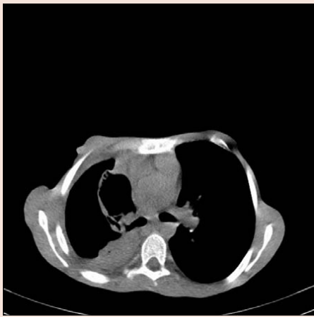
Figure 7: Perforated hydatid cyst and pleural effusion on the right.

was 26.94% [7,12]. 22.77% of 176 cases with perforated hydatid cyst were detected to have pneumothorax. Two of these (1.13%) were tension pneumothorax. Pleural effusion in 36 (20.45%) cases, empyema in 35 (19.88%) cases, and pleural thickening in 17 (9.65%) cases were detected [12].