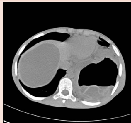
Figure 3: Intact on the right, perforated hydatid cyst on the left.

The complications in ruptured hydatid cysts are seen more frequently compared to intact cysts hydatids [8]. Complications of a ruptured cyst can be ordered as: asphyxia (membrane and cyst fluid expectoration), hemoptysis, anaphylactic shock, respiratory failure, pneumonia, destroyed liver, bronchiectasis, pulmonary abscesses, empyema, pneumothorax, and aspergilloma in the cyst cavity (Figure 5). Additionally, a perforated hydatid cyst can cause extrapulmonary destruction in the sternum and ribs.