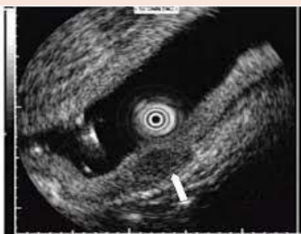
Figure 3: EUS Stomach.