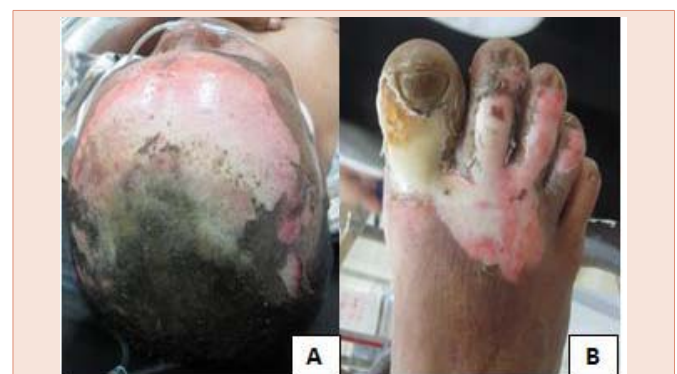
Figure 1: A Electric Source inlet on Vertex; B. Outlet Electric wave on pedis.

Grading of burn injury divided to First degree includes only the outer layer of skin, epidermis usually appear red and very painful, Second degree divided into two partial thickness involve entire epidermis full thickness involve entire epidermis and most of the dermis with diminished sensation, third degree involve all layers of