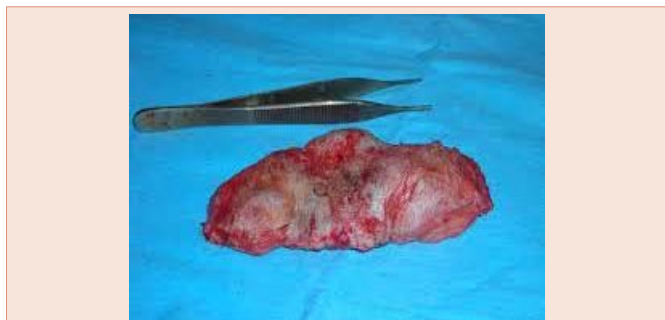
Figure 3: QUART.

chemotherapy for patients filling requirements (fit) for the cycles of adjuvant chemotherapy should be undertaken, especially if women are estrogen-negative and / or positive axillary nodes. Attention should be paid to the obviously increased susceptibility of older blocks and spinal cord infections, antibiotic-resistant species of bacteria, blocks marrow can be fought with growth factors (CSF). The lines are the most widely used therapeutic associations CMF and TASSANI, albeit with limitations. As for the use of trastuzumab, the drug can certainly improve the effect of the CHT, but clinical data are lacking: still has to be pointed out the risk of heart failure. In metastatic disease it can be used hormone therapy, chemotherapy, anti HERC2, bevacizumab. The clinical- experimental are still insufficient for a reasoned choice