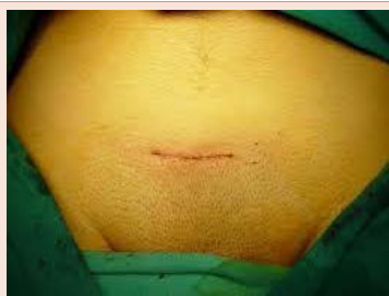
Figure 1: Suprapubic incision.

In patients receiving surgical treatment, the significant fact that we found is as the removal of the obstacle urinary flow associated with a strengthening of the band with the affixing of prostheses, has resulted in a reduction of hernia recurrence, especially in patients in group B. This indicates that the removal of the intra-abdominal pressure is effective and able to prevent recurrences hernias [5]. The affixing of the prosthesis thanks to the continuous evolution of materials and improved surgical technique, developing enhanced early hernia repair and the further reduction of the relapse rate. The simultaneous treatment of the two diseases in terms of satisfaction in patients treated has produced excellent results. Patients with one time interventions are not exposed to additional risks. Both