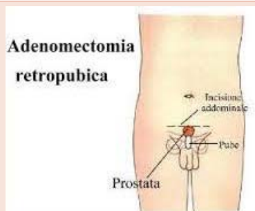
Figure 2: Anatomical position.