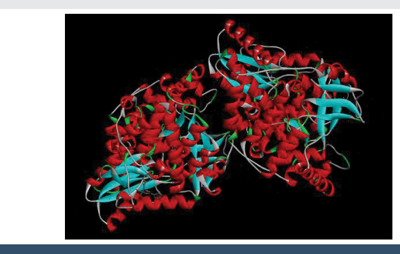
Figure 1: Hepatitis C Virus RNA Dependent RNA polymerase.

Then it is opened in discovery studio which was already installed. Hydrogen is added to the ligand to fulfill its valency, then further modification was done to the original ligand molecule and it was saved as PDB file. After that this PDB