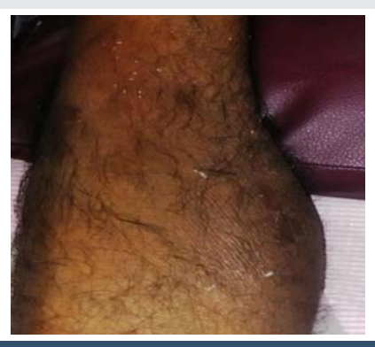
Figure 2: Skin involvement in our case-pigmentation, induration and asymmetrical distribution seen.