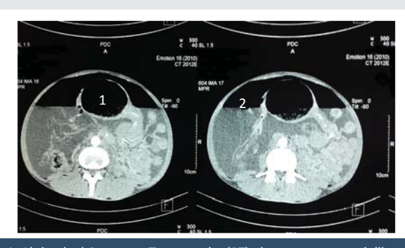
Figure 1: Abdominal Computer Tomography (CT) shows a segmental dilatation of the small intestine (1) and a massive pneumoperitoneum (2).

No mass was palpable. Laboratory tests showed a high white blood cell count at 12.800 E3/uL and anemia at 9.2 g/dl. Abdominal Computed Tomography (CT) revealed a massive pneumoperitoneum, ascites and a segmental dilatation of the jejunum (Figure 1). The patient was admitted in the operating room, and laparotomy was done with midline incision. About 5 liters of reactive fluid were sucked. A segmental dilatation of the jejunum was found at 50 cm from the ligament of Treitz with a perforation on its ante-mesenteric side (Figure 2). There was also a large mesenteric lymphadenopathy with an infiltration of the mesentery (Figure 3). The other segments of gastrointestinal tract, the liver and the spleen were normal. An intestinal resection was not technically feasible due to the