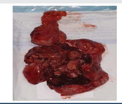
Figure 4: Operating specimen of appendectomy with left adnexectomy.