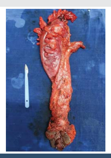
Figure 6: The resection specimen.

perirectal adipose tissue. The colonic border was clean and the anal border was less than 1 mm. Also, the infiltration of the soft tissues of the anterior perineum biopsy was tumoral and the p16 status was negative. Then, the patient began adjuvant FOLFIRINOX.