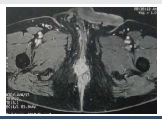
Figure 5: Control pelvic MRI revealed tumoral thickening of the anal canal.

whose intraoperative findings reveal infiltration of the soft tissues of the anterior perineum, which was biopsied (Figure