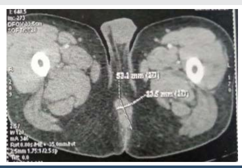
Figure 3: CT scan pelvic slide revealed an infiltrating process involving the distal part