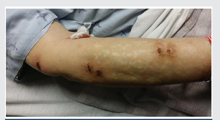
Figure 1: Yellowish discoloration of skin with bull's eye like lesions over right lower arm and forearm.