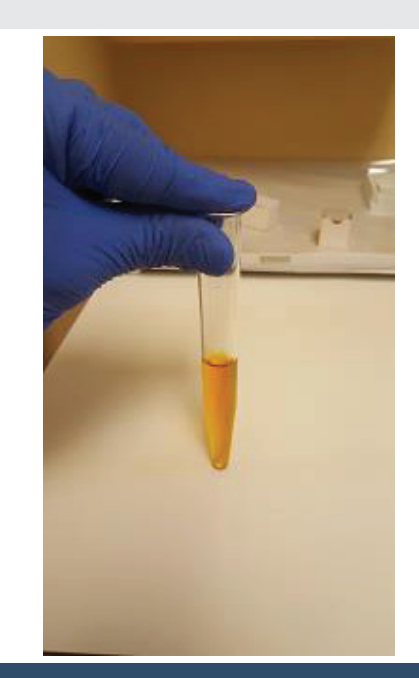
Figure 2: Urine showing orange discoloration.