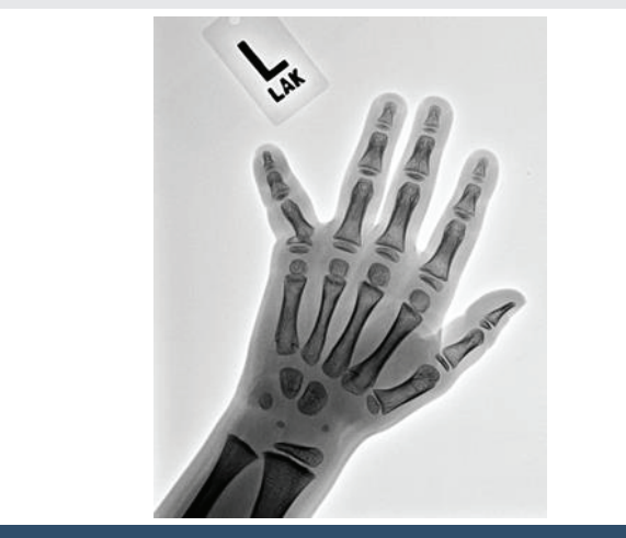
Figure 2: X-ray showing lateral deviation of the small finger proximal phalanx due to an Extra-Octave fracture.