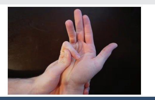
Figure 4: 90-90 Demonstration of the 90/90 flexion method of reduction.

have excellent outcomes. Non-displaced fractures of the small finger proximal phalanx can be treated without reduction using buddy tape. There is no difference in time to recovery between the buddy tape and reduction groups. The displaced fracture can be reduced by either the pencil or 90/90 method. None of the patients went on to be concert pianists.