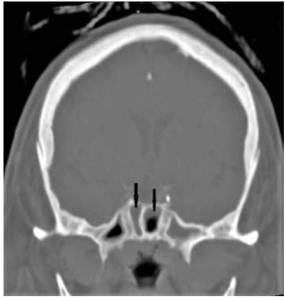
Figure 2: Sphenoid sinusitis—Arrows showed fluid in bilateral sphenoid sinuses on CT Head coronal view.