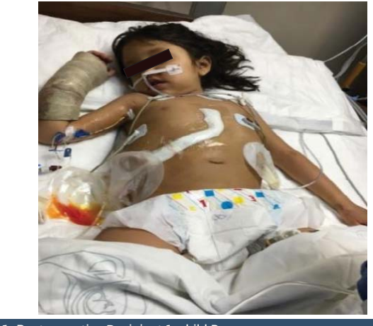
Figure 1: Post-operative Recipient 1, child B

Donor and recipient selection are the most important for the successful use of partial grafts, the main reason that we presented this work with 2 different receptors [4,11,12]. However, a good donor selection criterion include ABO compatibility, age, liver function, sizemacth, absent/ scant arrest period, vasopressor requirements, serum sodium concentration and brief donor hospitalization [11-13]. Split liver transplantation entails greater requirements in term of time, material and human resources than conventional whole organ liver transplantation and, unavoidably, a learning curve. Favorable liver graft allocation policies and collaborative coordination among centers represent the basis for a rational, extensive use of this donor source [5,12,13]. In our donors we had used area transportation by the large distance, we had a directly communication with the coordination and the Hospital (Pediatric Hospital CMNSXXI, IMSS). The first recipient had a better weight and child B than the other recipient with child C (Figures 1-4).