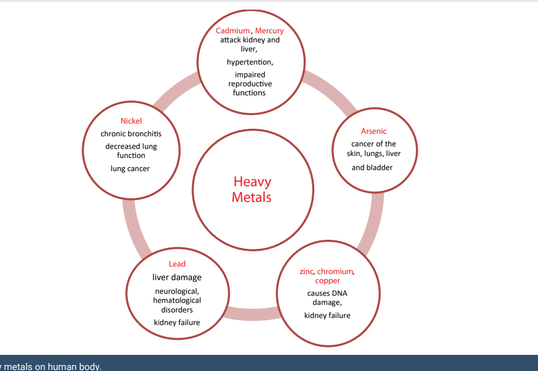
Figure 3: Impact of heavy metals on human body.