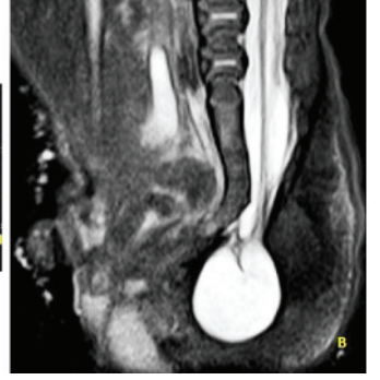
Figure 2: A, B: Ultrasonography (A) & MRI (B) shows lumbosacral myelocystocele, tethered cord, and syrinx.

Because of its rarity and sporadic occurrences, some environmental and genetic factors may be responsible for its causation [6]. One study reported maternal exposure to diphenyl hydantoin and valproic acid and cigarette smoking as possible risk factors [2,6,9]. Higher incidence of OEIS in monozygotic twins than in dizygotic twins suggesting a possible genetic contribution to the occurrence of these defects was reported [10].