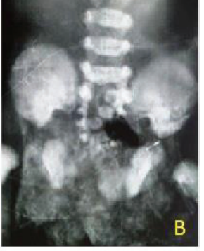
Figure 1: (A) Exomphalos, two hemibladders and central open bowel mucosa. Well formed scrotum with bifid penis. (B) Plain x-ray showing vertebral anomalies.