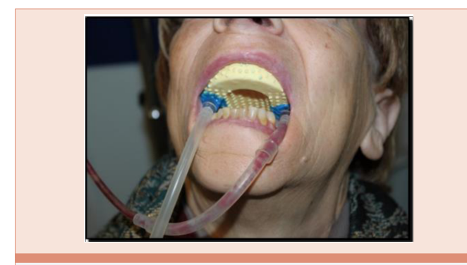
Figure 2: Oxygen/Ozone treatment.