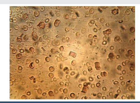
Figure 1a: Images obtained by microscopy of erythrocyte suspensions from: (a) Control;

Examples of images of red blood cells untreated and treated with different concentrations of NBL are presented in Figure 1. A decrease in the number of isolated cells and an increase of the aggregates in the RBC treated were observed compared to the control, the most notable effect is when the concentration of NBL used in the treatment was higher. RBC untreated showed a large number of isolated cells and some small aggregates,