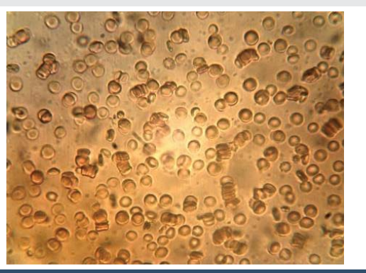
Figure 1d: Images obtained by microscopy of erythrocyte suspensions from: (d) RBCs treated with (500±50) larvae/mL.