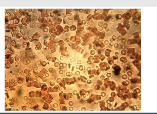
Figure 1e: Images obtained by microscopy of erythrocyte suspensions from: RBCs treated with (1000±50) larvae/mL.