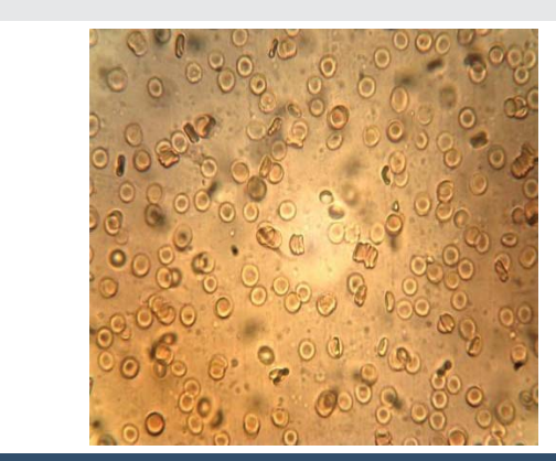
Figure 1b: Images obtained by microscopy of erythrocyte suspensions from: (b) RBCs treated with (100±50) larvae/mL.

Figure 1a: Images obtained by microscopy of erythrocyte suspensions from: (a) Control;