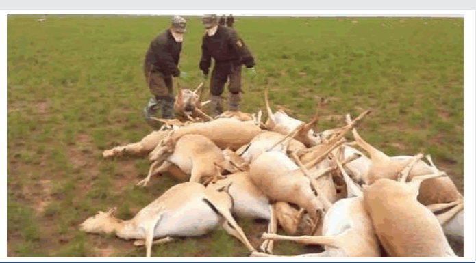
Figure 4: The mass death of saiga in the south Kostanay region [9,25,38].

148800 carcasses of saigas were utilized. From them in the Kostanay region -127775, Aktyubinsk- 10,358 and Akmolinsk -10667 heads.