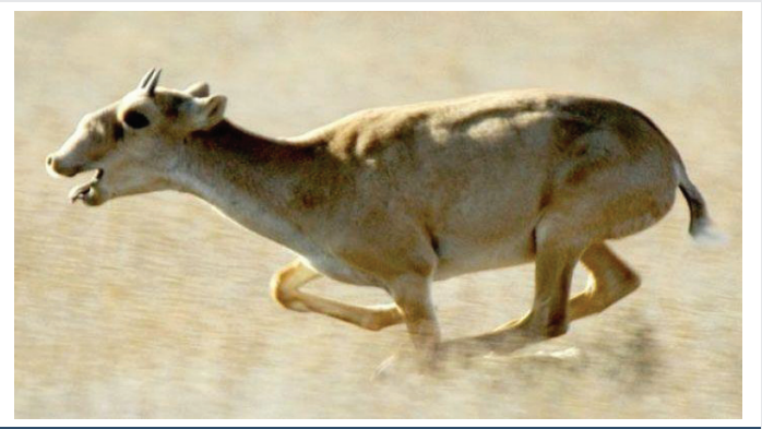
Figure 3: Saiga - a unique type of hoofed animals, the age-mate of a mammoth and rhinoceros, [9,25].

Generally it is juicy grass: Sálsola, Ephedra distachya, various species of worm wood (Artemísia), wheat grass comb (Agropyron pectinatum), Mortuk (Eremopyrum triticeum), Kentucky bluegrass (Poa praténsis), fescue (Festúca valesiáca), Kermek (Limonium vulgar), boy Aly ch (Salsola arbuscula), Kokpek (Atriplex cana), Anabasis salsa (Anabasis salsa), kochia (Kochia scoparia), sorrel (Rúmex), which accounted for 98% of the stomach contents. Careful analysis showed that most of them are not only nutritious but contain medicinal properties [25].