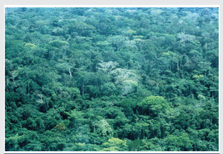
Figure 32: Dense Humid Lowland Forests of the Congo Basin, Southeastern Cameroon, 1990s.