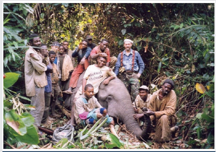
Figure 37: Forest Elephant (Loxodonta cyclotis) taken on self-guided hunt with Baka Pygmies & Maka Hunters, Zoulabot II, south of the Dja River, Cameroon, 2000. Note - taken on internationally recognized CITES quota, trophies legally imported into South Africa, but USFWS said it could never be imported into America.

their former colonies at COPs 10 and 11 (Francophone Africa Delegates to CITES COP 10 and 11, pers. comm)<sup>15</sup>" [1].