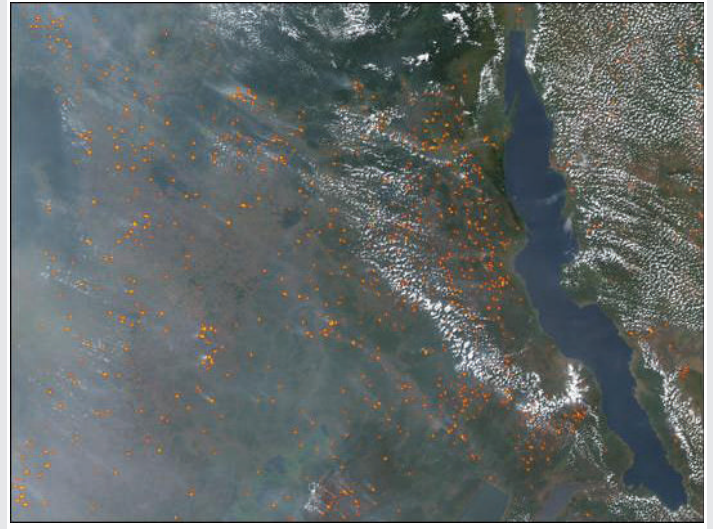
Figure 17: Fires from slash and burn agriculture west of Lake Tanganyika in East-Central Africa. May 23, 2004 as forests are turned into agricultural plots by an evergrowing population stuck in poverty & subsistence.