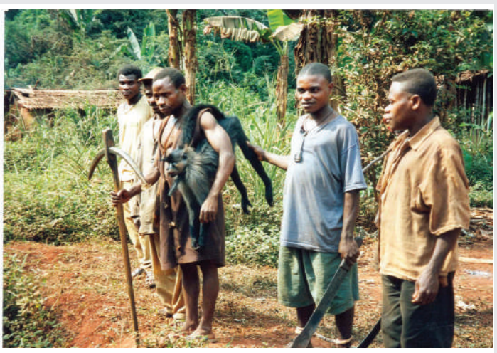
Figure 29: Traditional Natural Historians, Baka Pygmy Hunters, Arbalete/crossbow and poisoned bolts, Southeastern Cameroon, 1990s. Source Photo [1].

Tanzania, Zimbabwe, Botswana, Namibia) where wildlife had a potential to play a major role in conservation and development, and provided them with scholarships.