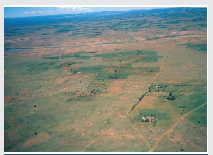
Figure 25: Movement of small-scale farmers, mainly Kikuyu into former Maasai grazing areas in Kenya, resulting in major conflicts in the 20/21st centuries, 2000, Rift Valley taken from Nairobi/Naivasha Road.

being sold off to commercial wheat and maize farms. All of this is the consequence of Western donors teamed up with the animal rights movement to impose poorly thought out land use policies, combined with the concept that eco-tourism (preservation) would save both the wildlife and the people, with the consequences seen in these photos and wildlife surveys [1].