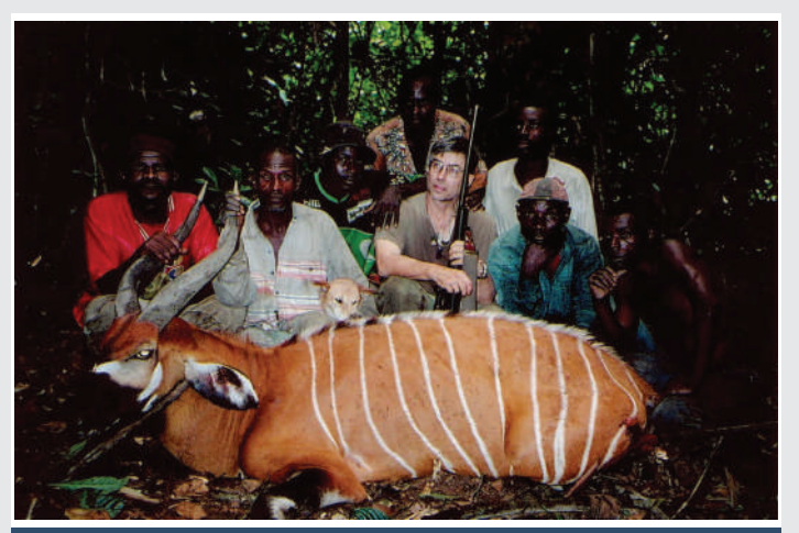
Figure 36: Trophy Hunting employs many people from rural Africa, is important in providing development opportunities for rural communities, and provides the budget for the operation of many game departments. Bongo (Tragelaphus eurycerus) taken with Tikar Hunters, village of Kong, just north of the old German capital Yoko, Southeastern Cameroon, 2005. Note Basenji, one of the oldest breeds of domesticated dogs in the world, originating from Central Africa and depicted on paintings in Egyptian pyramids. The "voiceless dog" is prized for its hunting skills.