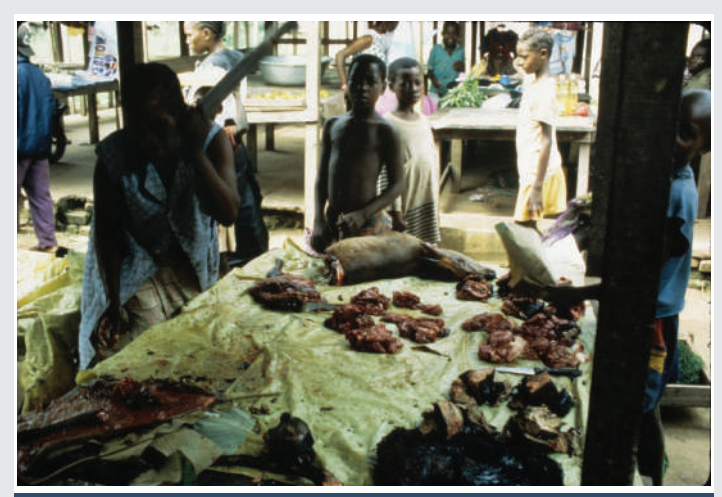
Figure 3: Bushmeat, a major source of protein for much of Sub-Saharan Africa, in Ouesso Market, Congo-Brazzaville, 1995.

I can't tell you how many times I have heard game guards and even traditional hunters (poachers) come to the same conclusion - you have one of two choices if you don't want the poachers to poach, kill them or help them find another way of life (Figure 7) - which could be integrating them into the management of these natural areas so they don't have to poach and/or educating they and their children so they are able to pursue alternative livelihoods.