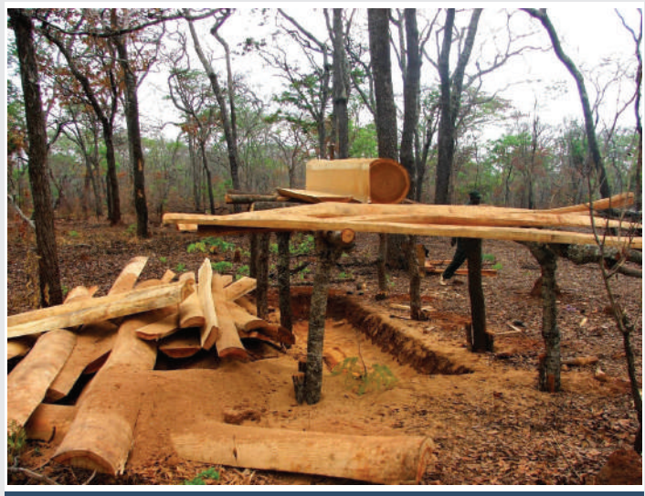
Figure 14: Unmanaged pit sawing, along with charcoal making, contributing to deforestation across. Sub-Saharan Africa.