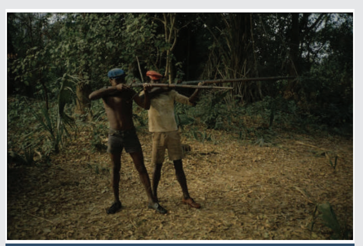
Figure 31: Traditional Hunters, considered poachers by most African Governments and NGOs, with their Fusil de Traite/Trading Musket, Fouta Djallon, Guinea 1980s.

Given the situation today – for every poacher you capture or kill, if I am some corrupt middleman (politician, businessman, bureaucrat, etc.), I'll find another desperate soul to take his place and give him a gun to kill elephant, rhino or even game for bushmeat. As with Radical Islam, the solutions to poaching are education and economic development. In rural areas, this can occur through integration of traditional hunters/natural resource users into the management of "THEIR" natural resources on "THEIR" traditional lands so they don't have to poach, while empowering them to prevent access to "THEIR"