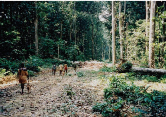
Figure 33,34: Dense Humid Lowland Forests, primarily the domain of the Baka Pygmies, opened up to uncontrolled commercial poaching by commercial logging roads, Southeastern Cameroon, 2000s.

natural resources by noncommunity members. As noted, some youth from these rural areas should be sent off for tertiary training in wildlife management/nature conservation, with signed agreements to return home upon completion of their education to serve as wildlife/natural resource managers for their communities. Simultaneously, pressure must be taken off these rural areas by helping Africa urbanize & industrialize, thereby creating an urban middleclass. Gun barrel diplomacy is at most a short-term solution, but in the long-term fails [1,2] Figures 35-37.