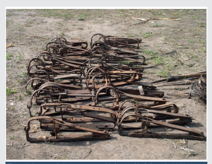
Figure 6: Snares and gin traps recovered in hunting block Coutado 14, Merromeu Game Reserve, Mozambique, 2000s.

We can all agree that to Save Africa's Wildlife we must first Save Africa's People. With a human population that will more than double in the next 50 years, unless there are major changes, the 2000 Sub-Saharan African population at about 622 million is projected to more than double by 2050 (Figures 12,13). If the majority of the people are stuck in subsistence lifestyles and/or in urban slums rotating back and forth between urban and rural areas poaching wildlife, timber (Figures 14-16), fish, etc. and converting natural systems into man-made systems for farming (Figure 17) and livestock, what Zimbabwean professional hunter (PH) Andy Wilkinson coined "Politics of Despair" – then the people and the wildlife are doomed [1,2].