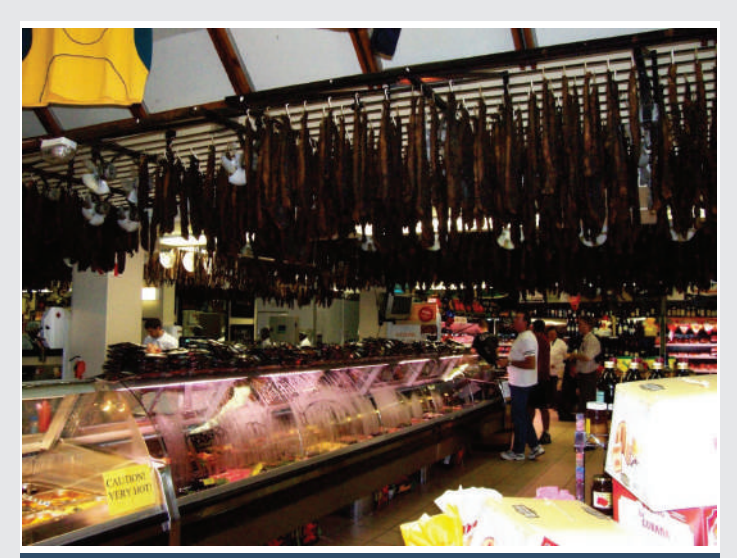
Figure 22: Typical South African Butchery circa 2007, with Game & Beef Biltong, Jerky hanging from the ceiling. South Africa has the largest sustainable commercial bushmeat trade in the World & with properly trained people and appropriate policies, bushmeat can be sustainably managed as an economic, nutritional and cultural resource throughout Sub-Saharan Africa.

per Peter Beard [8]. Just look at Kenya's wildlife today that closed hunting in collaboration with Western Donors and their Animal Rights NGOs and whose game populations have been devastated by rural people [Figure 23] who own their land but not their wildlife, receiving little economic benefits from this natural resource: