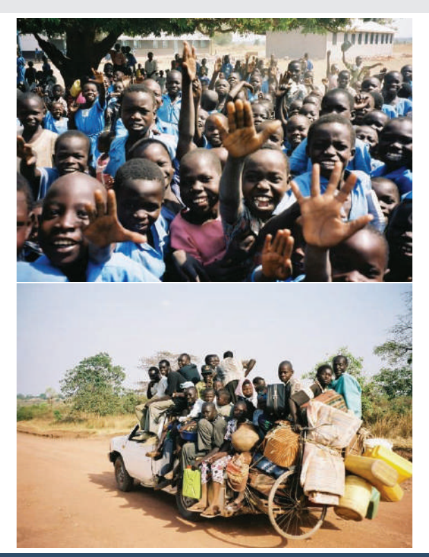
Figures 12,13: The biggest threat to Wildlife in Sub-Saharan Africa is habitat loss from a human population stuck in subsistence lifestyles that will more than double in the next 50 years, Uganda, 1990.