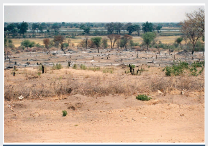
Figure 30: In much of Southern Africa, elephants (Loxodonta africana), which consume up to 250 kg of food a day/elephant, are over-populated and destroying forested wildlife habitat, especially in Namibia, Botswana, Zimbabwe and South Africa. Elephant Damage, Mahango Game Reserve, Caprivi, Namibia, 1995.

Well right now foreign aid is a Hand Out with minimal impact on the people or the wildlife. Changing how the millions in foreign aid are used could be a Hand Up - Education, Education, Education – and then we would see Africa change just as noted in America during the 20 century when we went from large rural farm families (lots of kids, cheap labor as today in Africa) to better educated urban families of maybe 2 children/family - where children have become consumers as opposed to producers, thus costly and more of a reason to have 2 children instead of 11, as with the author's Mother's generation. Thus, changing how foreign aid is spent could help stem the biggest threat to wildlife - the more than doubling of Sub-Saharan Africa's human population in the next 50 years, and the resulting loss of habitat from people stuck in subsistence lifestyles, and make conservation work for AFRICANS and not the urban yuppies from America & Europe flooding Sub-Saharan Africa to save Africa's wildlife from you Africans.