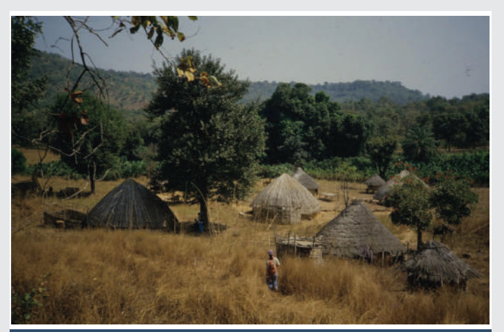
Figure 2: Typical Village, Eastern Senegal/Guinea, 1980s, with ever-expanding human populations encroaching upon wildlife habitat.

its people. To continue blindly along this line of thinking is just as bad as being in the animal rights movement - as in the long-term it will mean the demise of Africa's wildlife and a bleak future for its people.