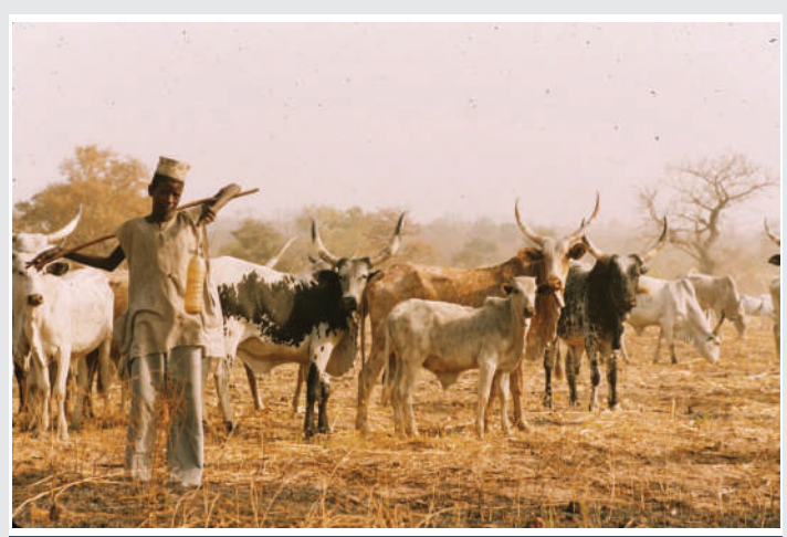
Figure 18: Fulani Herder inside Bénoué National Park, Northern Cameroon, 1990s. Not uncommon across Sub-Saharan Africa. Many of these parks once served as critical dry season grazing areas for both wildlife and livestock. As human populations increase and pasture is converted to farmland, there are increasing herder/farmer conflicts, as well as increased uncontrolled grazing in national parks.

And then as a means of influencing "conservation" policies that often end up being more protectionist than conservation/ sustainable use, there are the donor funded trips for the