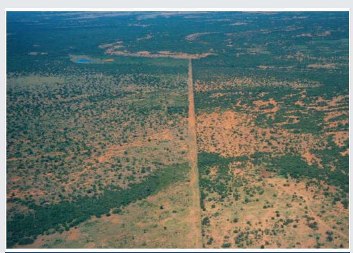
Figure 26: Wall built along border of Kifluku Farm, Laikipia Kenya to keep wildlife from interfering with livestock, as wildlife had no value to White ranchers Clive & George Aggate.

Due to the antiquated laws of the Kenya Wildlife Service (KWS) that favor Livestock over Wildlife, in the 1980s, White ranchers Clive (pers. comm.) and George Aggate of Kifluku Farm, Laikipia Kenya, built a stone wall around their 3,644 ha (9,000 acre) farm and shot out all wildlife [Figure 26]. They then approached the Kenya Wildlife Service and explained that they had the right to control problem animals and since wildlife had no direct value to them, they were all problem animals bringing in tick borne diseases, and competing with livestock for pasture. Until they could obtain reasonable value from wildlife, they didn't want wildlife on their land, being no different than any smallholder. Clive challenged the Kenya Wildlife Service (KWS) to take him to court. They refused,