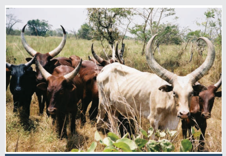
Figure 19: Ankole Cattle, Uganda 2002. As human populations increase so do their livestock, which displace wildlife, often a sign of wealth, as well as food.