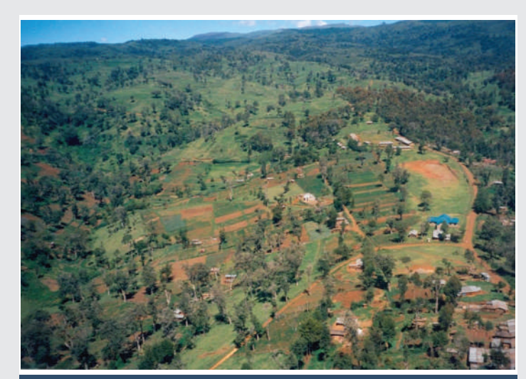
Figure 24: Sub-divided Kikuyu Highlands late 1990s, Kenya with little room for expansion except into marginal areas putting them into conflict with traditional pastoralists in the 20th and 21st centuries.