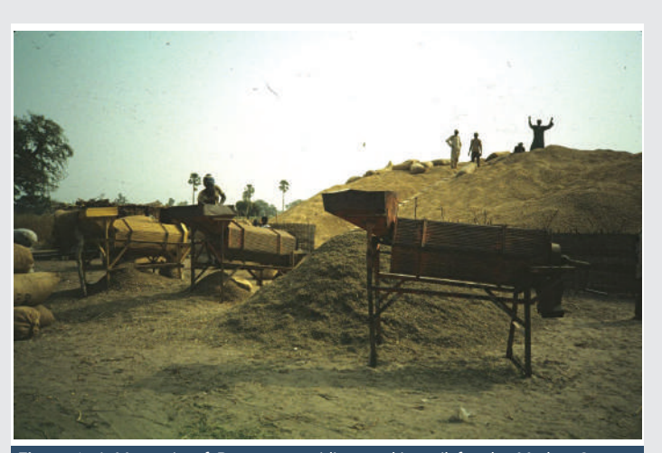
Figure 1: A Mountain of Peanuts providing cooking oil for the Mother Country (France), while displacing wildlife, Senegal 1980s.

One thing that bothers me from what I have experienced is what I call "Blind Flag Waving Conservation", as though conservation in Africa is the end all, the savior of wildlife and