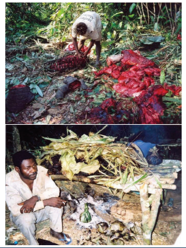
Figures 4,5: Butchered Elephant, Southeastern Cameroon [1]. Elephant meat smoking over fire, Southeastern Cameroon.