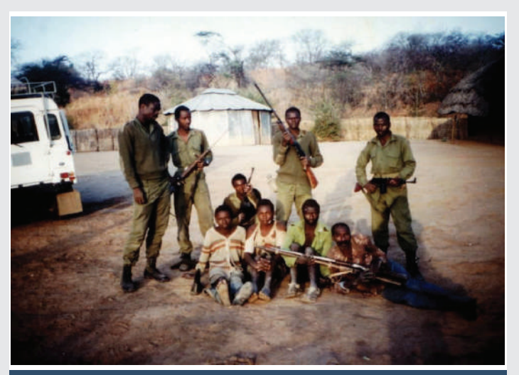
Figure 7: Elephant "poachers" captured by game guards, Munyamadzi Corridor, Zambia, early 1990s. Game guards said, "we have one of two choices, either shoot them or help them find viable long-term employment" [1,4]!