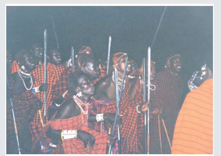
Figure 23: Proud Maasai Moran/Warriors during ritual, famous for group lion hunting with spears, Tanzania & Kenya, 1990s. Maasai pastoralists traditionally cohabited with wildlife throughout Kenya and Tanzania.

per Peter Beard [8]. Just look at Kenya's wildlife today that closed hunting in collaboration with Western Donors and their Animal Rights NGOs and whose game populations have been devastated by rural people [Figure 23] who own their land but not their wildlife, receiving little economic benefits from this natural resource: