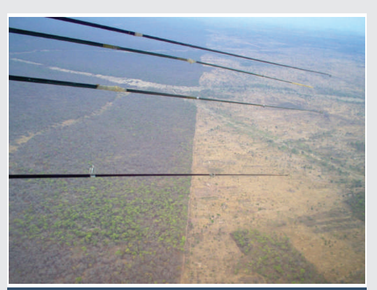
Figure 27: Tanzania, 2004, prior to above-mentioned importation ban of elephant and lion trophies into the United States. Well managed Kigosi Hunting Block, Western Tanzania on left and on right Habitat Degradation from Human Compression combined with Human/Livestock Population increases.

enough tourists to be profitable and subsidize another 14 national parks not viable for tourism. As of 2020, the Tanzania National Parks Authority (TANAPA) has taken over most of the hunting blocks around the Selous Game Reserve, as well as those associated with Burigi, Biharamulo and Kimisi, so national parks now comprise about 14–15% of Tanzania and hunting blocks, though significant, less than 25%. About 70% of hunting revenue to Tanzania comes from American hunters. Most hunting areas are not viable for ecotourism lacking the scenery and numbers/diversity of wildlife compared to the top national parks [7]<sup>11</sup>.