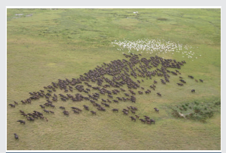
Figure 21: Safari Operators, sharing benefits, employing and involving rural communities \ in \ conservation, through \ CBNRM \ (Community \ Based \ Natural \ Resource Management) contribute to the conservation of the most diverse mega-fauna in the World – that of Sub-Saharan Africa. Cape Buffalo (Syncerus caffer caffer) herd in one hunting block Coutado 14, Merromeu Game Reserve, Mozambique, 2000s.

Closing hunting, given the current socio-economic situation in Africa today, means "The End of the Game" as