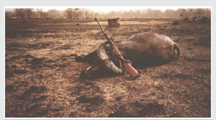
Figure 11: Typical West African Savanna Buffalo ( Syncerus caffer brachyceros ) taken with traditional hunter Wali Samurhaï, 1980s.

This brings me back to conservationists (us hunters and fishermen, ecologists, wildlife managers, safari operators, etc.). There is a need for the African conservation community to meet with the U.S. Fish and Wildlife Service to discuss how many of their policies detrimentally impact Africa's wildlife, conservation and development programs (e.g., stopping