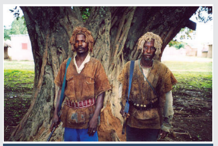
Figure 8: Dozo Hunter/Warriors, Comoé-Léraba Reserve is located in the southwestern part of Burkina Faso, on the border with the Ivory Coast .