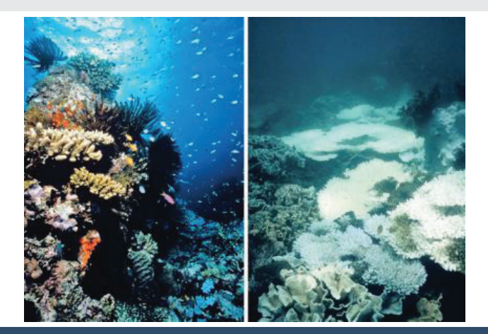
Figure 1: Marin Science Seminar: Ocean Acidification and Exoskeletons [3]

Sea water carbonate chemistry is stressed by ocean acidification and imposes negative effects on many calcifying organisms such as corals and bivalves. A study discovered