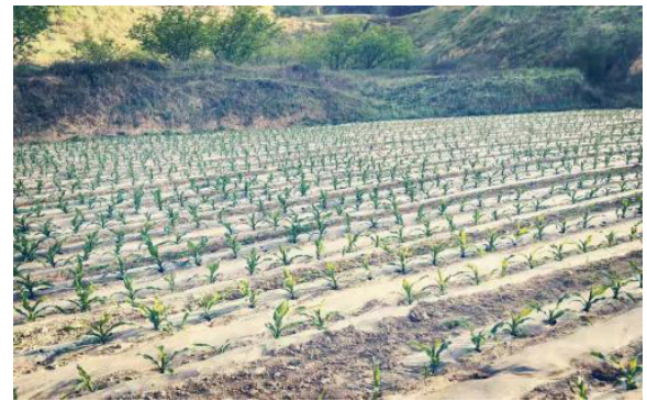
Figure 3: Photo of Corn thin film cover and ridge tillage in semiarid loess hilly region on 21 May 2021.

Plant- resources relationship in the growing season can be divided into different stages according to the resource use limit by plants such as soil water resources use limit by plants in the water-limited regions. If the available resources in the canopy are more resources use limited by plants or soil water resources in the range of the maximum infiltration depth is more than soil water resources use limited by plants, showing resources such as soil water resources enough and plants grow healthily. If not, more attention should be paid to the plant-water relationship regulation.