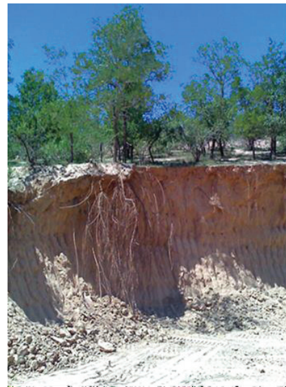
Figure 1: The Robinia pseudoacacia L. root distribution depth and maximum infiltration depth (290 cm) relationship in semiarid loess hilly region (Guyuan, Ningxia China).

The utilization limit of resources by plants includes spatial utilization limit of resources by plants, soil water resources utilization limit by plants in water-limited regions, and soil nutrient resources utilization limit by plants in soil nutrient-limited regions. For example, As time goes on and plant growth, plant height diameter, forest canopy volume, and root volume increase, and roots develop deep, soil water and nutrient resources in the root zone are reduced but available soil water resources are declined soil water resources in the root zone reduced but available soil water and nutrient resources are declined. In order to obtain maximum yield and beneficial results and achieve high quality and sustainable development, even if the root distribution depth is more than the maximum infiltration depth, Figure 1, plant roots do not absorb water indefinitely due to lack of water such as in semiarid loess hilly region (Guyuan. China) the precipitation changes with year and month, Figure 2 [1,8]. There should be a control limit for the utilization of soil water resources by plants in water-scarce areas, that is, the soil water resources use limit by plants [9,10]. It is the soil water storage when the soil water content is equal to the wilting coefficient in the range of the maximum infiltration depth. The wilting coefficient at