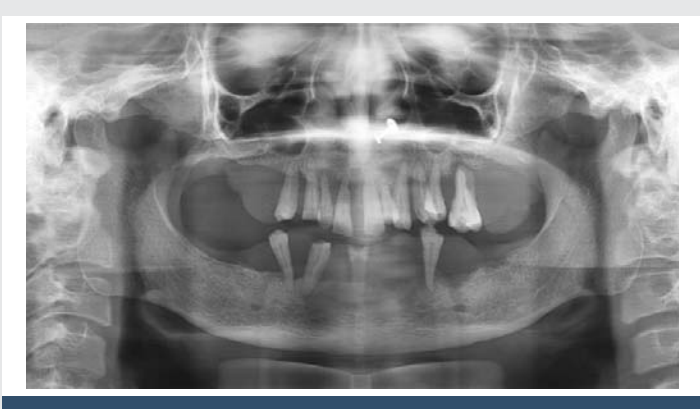
Figure 2: Orthopantomogram showing generalized severe alveolar bone loss.