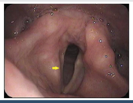
Figure 2 : Fibre-optic laryngoscopy showing left vocal cord palsy (marked by yellow arrow).