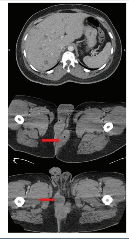
Figure 1: CT imaging of the abdomen revealing new hepatic low-density lesions with largest measuring 2.1 cm (top), perianal 8.3 x 3.7 cm region of induration and fluid with air contained within (middle), and Perianal soft tissue nodules that extend to the base of the penis (bottom).

The patient was presumptively diagnosed with metastatic adenocarcinoma of unknown primary. Initiation of palliative capecitabine was planned however the patient's hospitalization was complicated by perianal bleeding in the setting of thrombocytopenia, sepsis presumed secondary to hospital acquired pneumonia, and delirium. The patient expired one month from the time of diagnosis due to asystole cardiac arrest with no chemotherapy given.