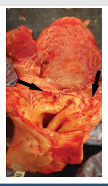
Figure 5: Native aortic valve with visible metastatic lesions (arrows).