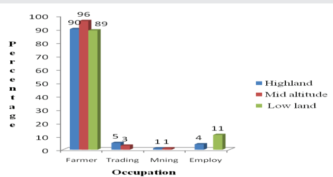
Figure 1: Occupation of surveyed households.

The overall structure of chickens holding of the surveyed households of the study district is depicted in Figure 2 below.