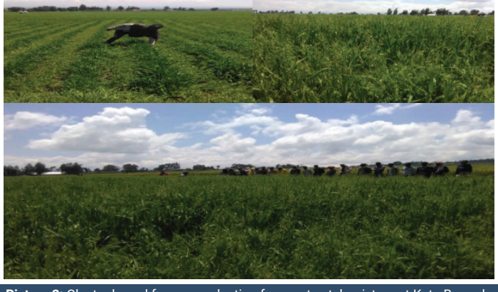
Picture 2: Cluster based forage production from oat-vetch mixture at Keta Berenda kebele of Dodola district in 2019 cropping season.

Table 4: Number of field day participants and their role.