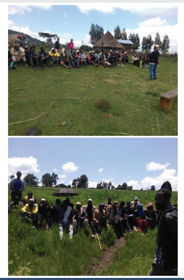
Picture 1: Farmers training on cluster based forage production from oat-vetch mixture at Keta Berenda kebele of Dodola district in 2019 cropping season. 361

Citation: Husein N, Diriba L (2021) Cluster based Oat-vetch mixtures for forage production in Dodola district of West Arsi Zone, Ethiopia. J Agric Sc Food Technol 7(3): 359-363. DOI: https://dx.doi.org/10.17352/2455-815X.000132